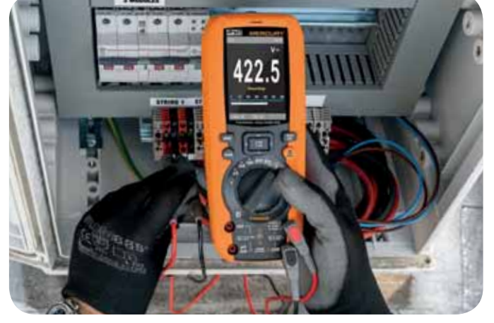
PV string Vmpp measurement