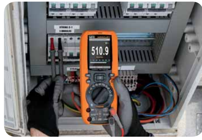
PV string Voc measurement